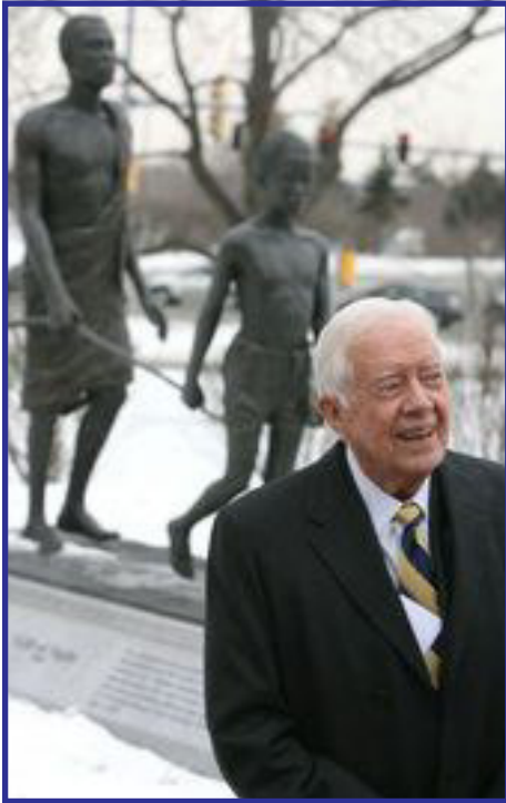
Former President Jimmy Carter in front of statue donated at international headquarters in Oak Brook.