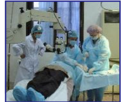
A patient undergoes eye surgery in China.

There are many times when I wish we could share the pictures that we see, but sadly do not always have a camera. The Chinese government is still observing what Lions are doing in China since they are the only service club allowed at the present time.