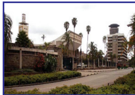
Kenyan Parliament, Nairobi

The promise of being able to see makes them put aside their fears and go into the unknown! The Lions of Nairobi pay for this hospital and its' staff. They also have a program that would truly bring tears to your eyes and touch your